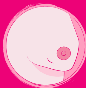
CHANGE IN SIZE OR SHAPE OF YOUR BREAST