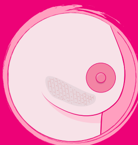
THICKENING, PUCKERING OR DIMPLING OF THE BREAST