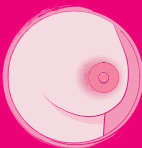
REDNESS OR RASH ON THE BREAST OR NIPPLE