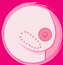
UNUSUAL PAIN OR SWELLING IN YOUR BREAST, ARMPIT OR COLLARBONE