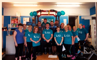
Fifteen Carnlough folk completed over 15,000 reps in our Push For Pounds Challenge and raised an incredible £3,500 for our counselling service for cancer patients.