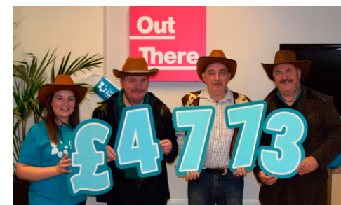
Over 20 staff were involved in the Out There Services' Tash for Cash fundraiser, which raised an outstanding sum for our men's services to help lower their risk of cancer.