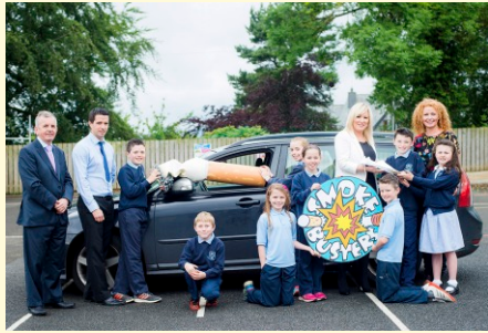
School children petition Michelle O'Neill on smoking in cars

We welcome the Health Department's decision to hold a consultation on regulations to ban smoking in cars carrying children. We've been campaigning on tobacco issues for many years and encouraged school children across Northern Ireland to petition Stormont to introduce the ban.