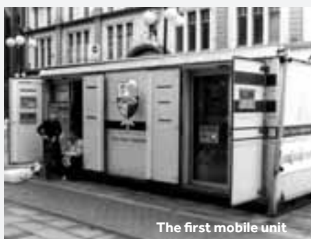
The first mobile unit

The aims Michael established have remained at the core of UCF's work and will continue to lie at the very heart of the work of Cancer Focus Northern Ireland - funding ground-breaking research, healthy lifestyle programmes to lower our risk of cancer, services to support people living with cancer and campaigns to influence legislation and public policy. As in the earliest days, the work of our organisation is funded almost totally by donations from the public.