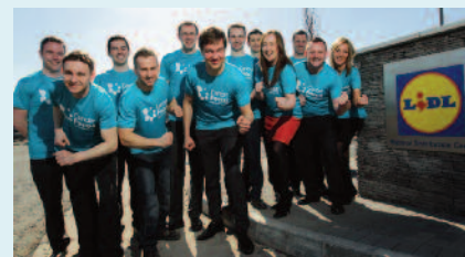
Huge thanks to the 15 teams and 12 solo runners from our charity partners Lidl NI who entered the Belfast marathon relay to raise funds for us

The Europa Abseil Team raised £2,547 abseiling down the hotel facade