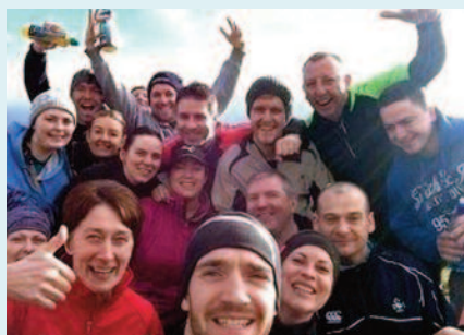
The six week Focus Fit 4 Challenge in Mid-Ulster, with help from Fit 2 Function in Cookstown, raised £21,236

Ballymena Walking for Health Group raised £1,300 at a charity walk