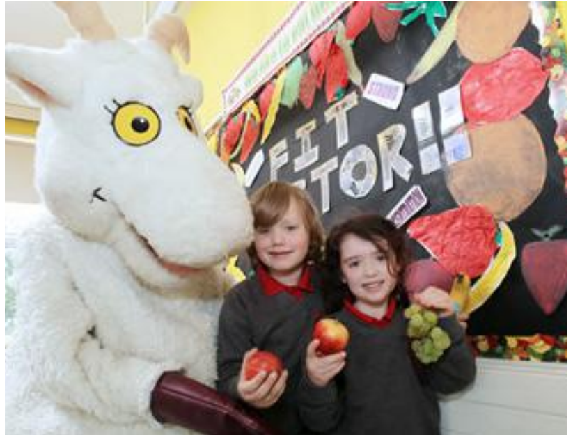
Genevieve, the Cancer Focus mascot, with Lidl Fit Factor finalists, St Nilles, Enniskillen