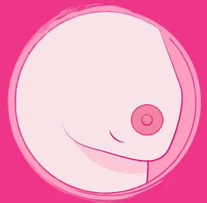
CHANGE IN SIZE OR SHAPE OF YOUR BREAST