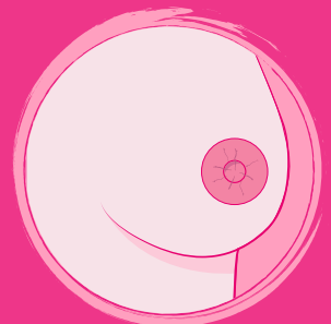
NIPPLE INVERSION OR NIPPLE DISCHARGE