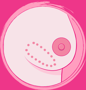
UNUSUAL PAIN OR SWELLING IN YOUR BREAST, ARMPIT OR COLLARBONE